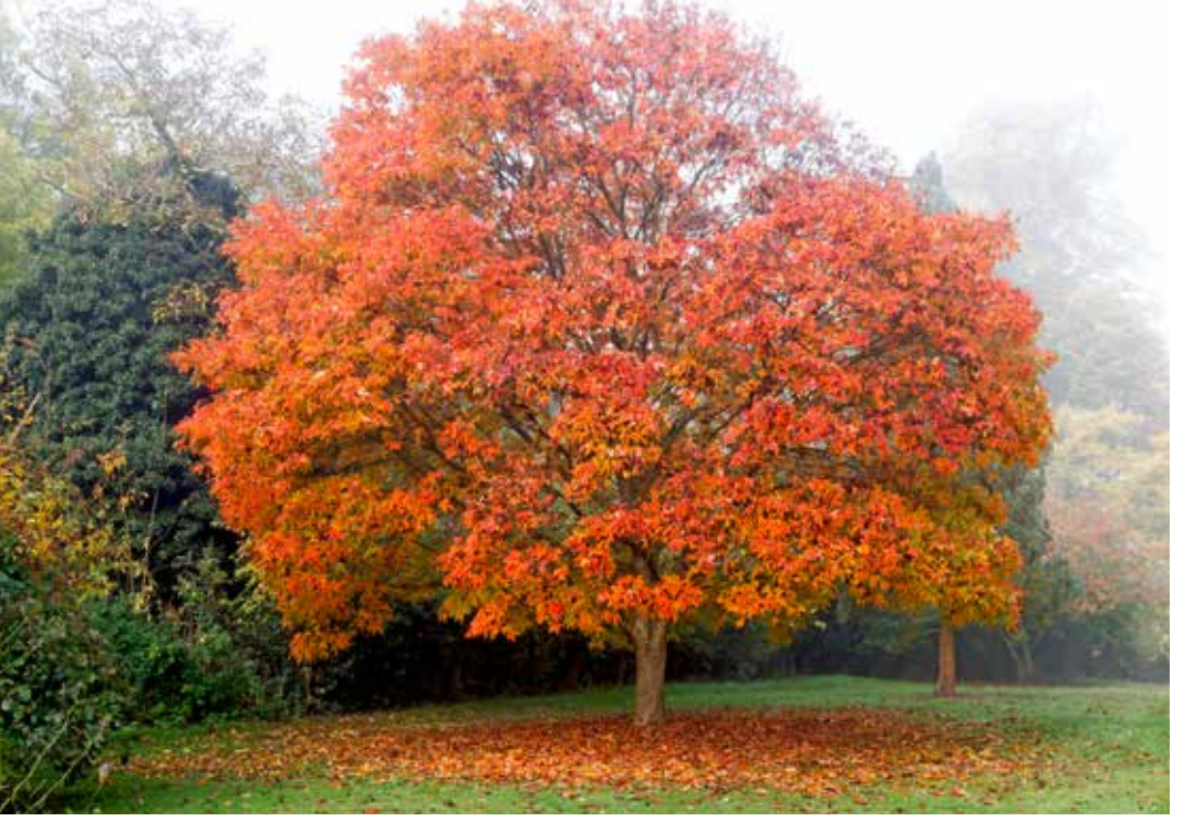
The three narrow-toothed leaflets of Acer triflorum turn gold and orange in autumn.