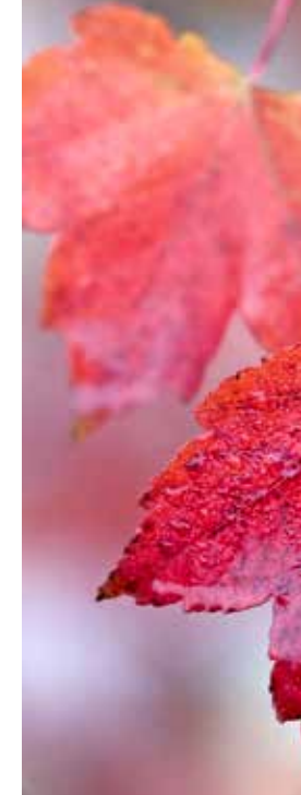
Acer rubrum 'October Glory' puts on a spectacular show into the last months of the year.