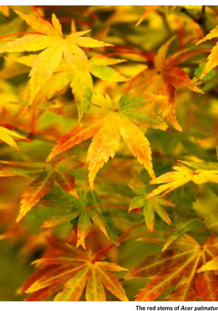
The red stems of Acer palmatum 'Sango-kaku' add to its autumn show.