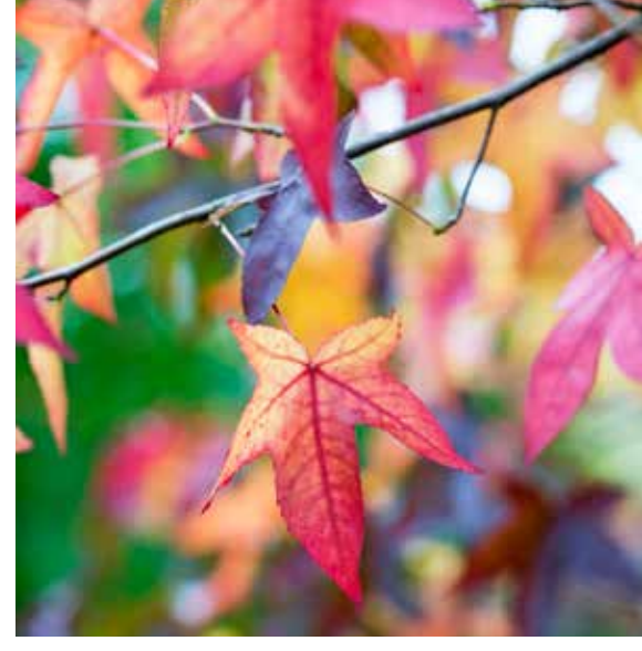
The fiery colours of Liquidambar styraciflua.