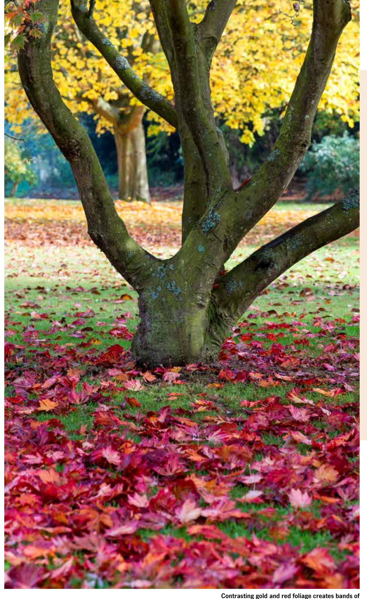
Contrasting gold and red foliage creates bands of flames across the grass.

Daws Hall Trust www.dawshallnature.co.uk 01787 269766. Autumn Colours Open Day: Sunday 22 October, 12-4pm. £5 adults, £1 children aged over five. The gardens are also open by appointment to Women's Institutes and garden societies, when Iain Grahame gives conducted tours. All proceeds from open days and tours go to the Daws Hall Trust.