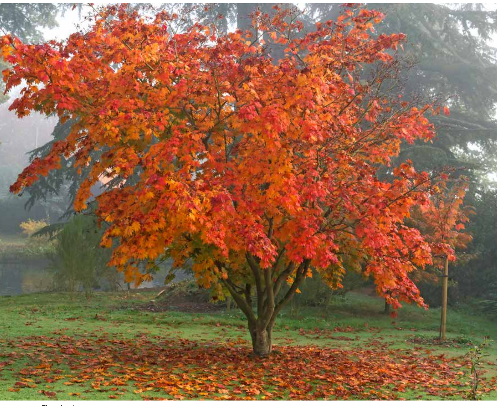
The red and orange palmate foliage of Acer palmatum var heptalobum creates a beacon of light in the autumn mist.