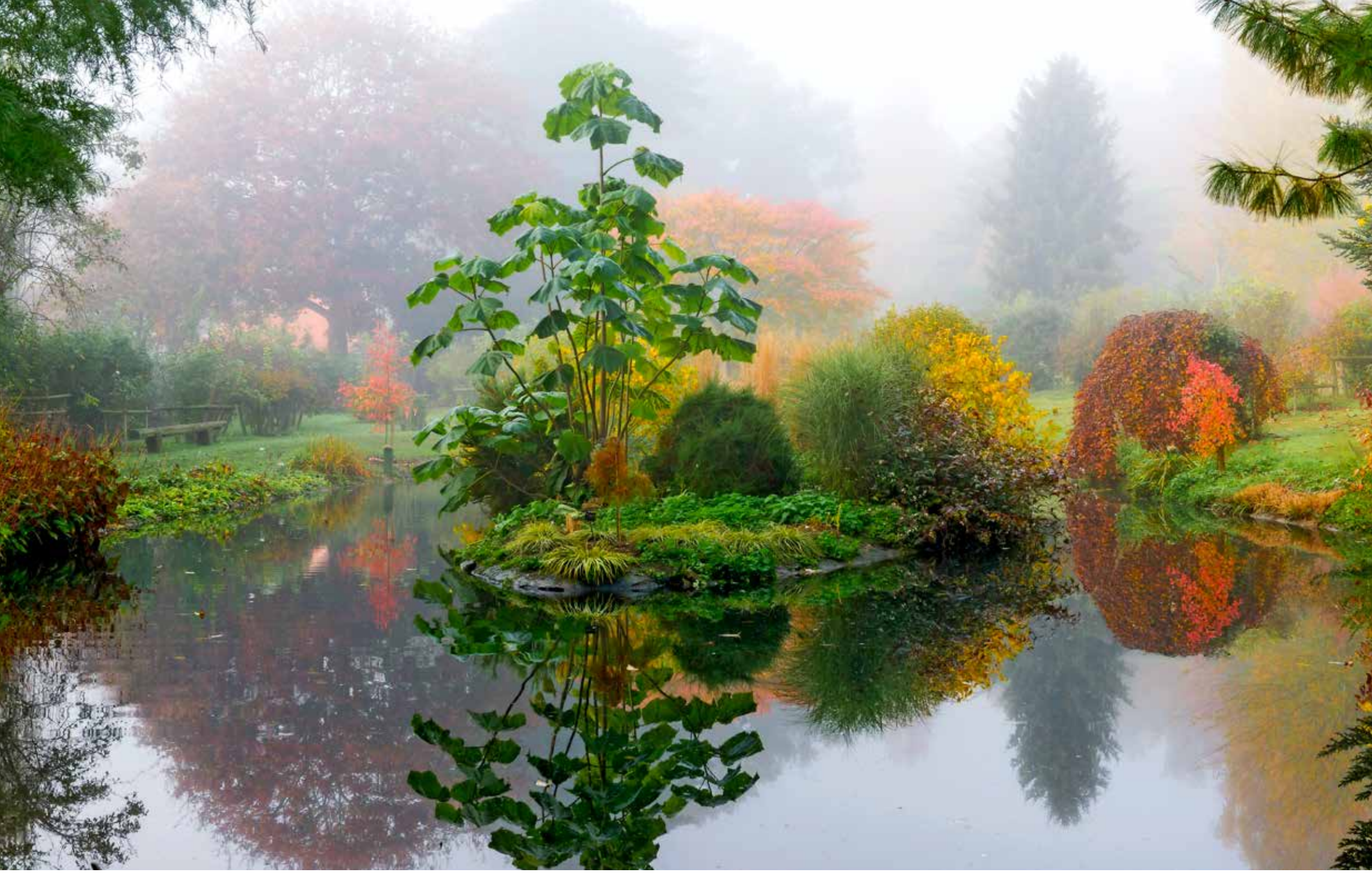
The coppiced foxglove tree Paulownia tomentosa casts its reflection in the still waters of the pond. Behind, autumn tints of maple, birch, beech, tupelo, dogwood and grasses brighten a misty day.

On the razed ground, he excavated two ponds below an existing pool that had been there for centuries. This was fed from a borehole that Iain was able to use to feed into the new ponds. Water continues down a gentle slope into the nature reserve, feeding a dipping pond used for educational purposes. Today a small flock of endangered Russian